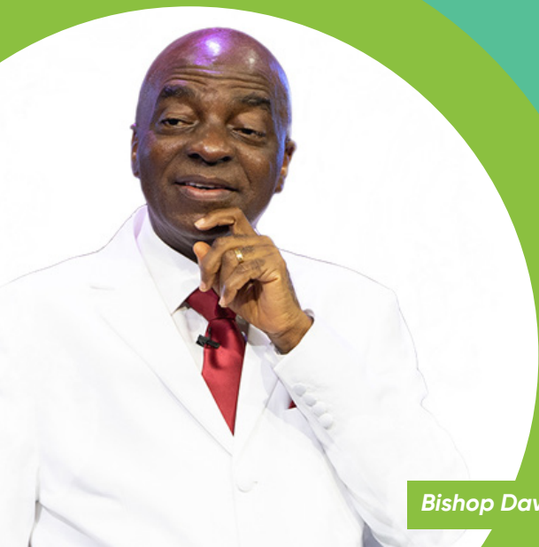
Bishop David Oyedepo